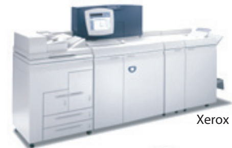
Xerox Nuvera 100