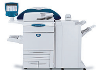
Xerox Docucolor 250